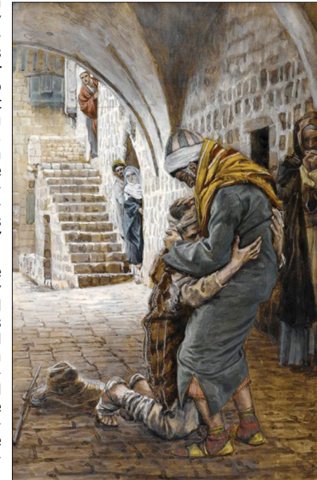
The Return of the Prodigal Son by James Tissot, in the Brooklyn Museum

at first calls it a "stepping over", but as his thoughts progress, he says forgiveness is more like "climbing over". Rising above my hurt and feelings of anger, "we have to climb over the walls of angry feelings, of fear of being used or hurt again... of pride, and the desire to stay in control." But, says Nouwen, every time we do that, we rise above our ego in the forgiving power of the death and resurrection of Christ. We learn, in Christ, to become as merciful and compassionate as our Heavenly Father is merciful and compassionate. How true the saying, to err is human, to forgive is divine!